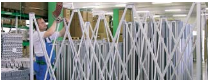
Products ready for shipment are debited electronically.