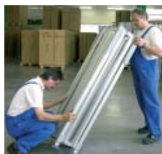
Final inspection before packing. Nothing is left to chance.