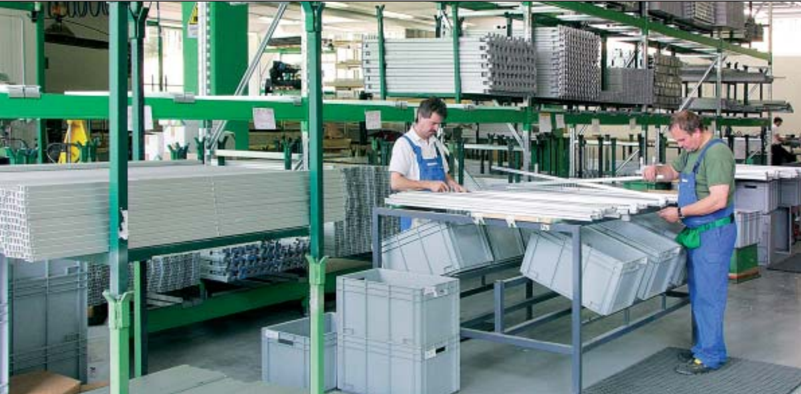
During final assembly, qualified in-house inspectors check the structures for flawless operation.